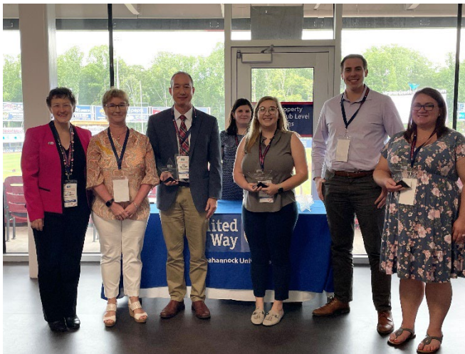
All-Star Awards: Virginia Partners Bank, Rappahannock Area Community Services Board, Rappahannock Electric Cooperative