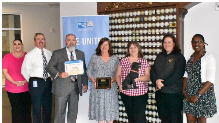
Fredericksburg City Government, Local Government Top Dog Award