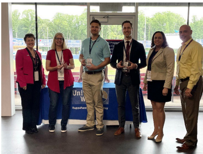
Star Awards: Target, M&M Auto Parts, Spotsylvania Regional Medical Center