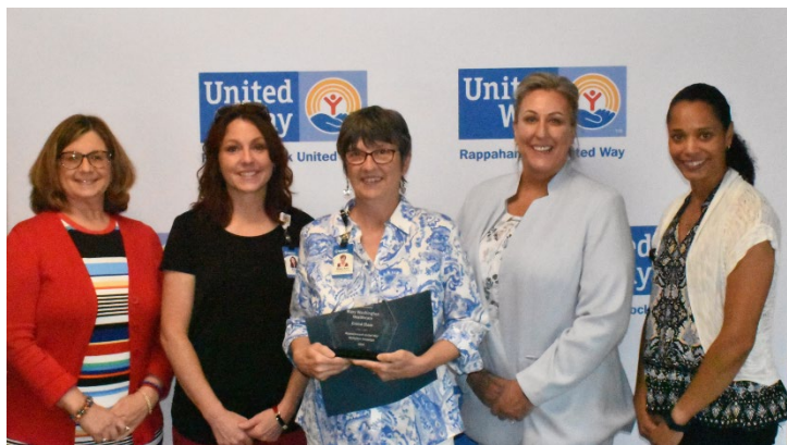
Mary Washington Healthcare, Grand Slam Award