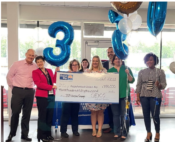
GEICO 2021 Workplace Campaign MVP Award Recipients – GEICO raised $350,000 for RUW