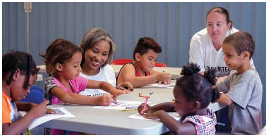
Individuals pictured are all local people in our community whose lives have been impacted by the Local Government Campaign.